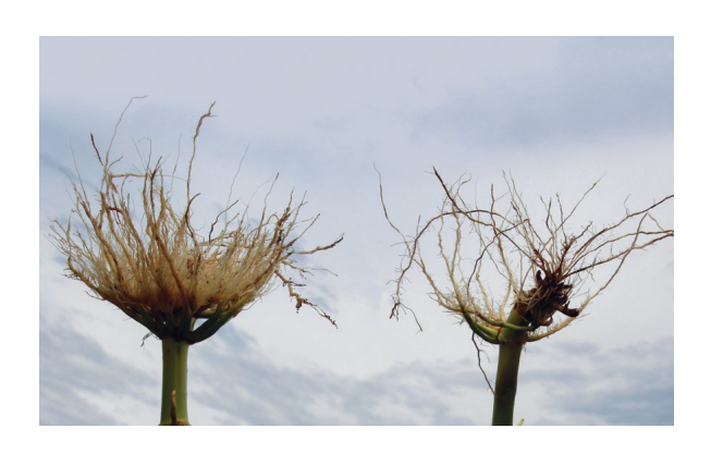
Hybrid with Qrome® technology