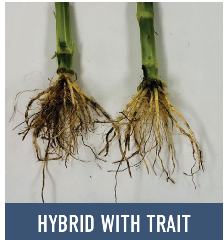
HYBRID WITH TRAIT