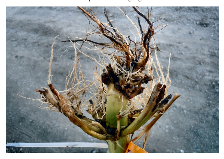
Figure 2. Heavy corn rootworm feeding on unprotected root. Corn rootworm damage reduces a plant's structural support and makes it more susceptible to lodging.