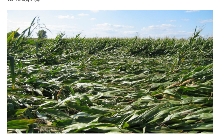
Figure 1. A combination of wet soils and strong winds can lead to lodging even if roots systems are healthy; however, plants with damaged or restricted roots are more susceptible to lodging.